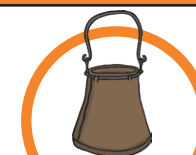
leather water bucket