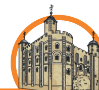
Tower of London