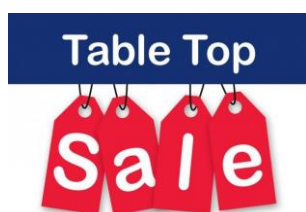
Table Top Sale Get a cheap bargain! Children's, women's and men's clothes and accessories sold on Fridays at our table top sale. Bring your change and grab a deal. Miss Slingsby will be running the sale most Fridays. The money raised will be used to buy resources and playground equipment.

Speech and language Workshop Our Speech and Language Therapist Kaeja will run an introductory 30-minute workshop for Parents on Tuesday October 18th at 9:10am in Reception classroom. All Reception Parents are invited to meet the therapist and hear about our exciting Launchpad for Language Programme.