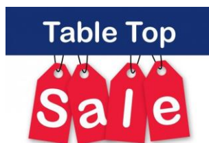
Table Top Sale

https://drive.google.com/file/d/13BCjmEHcFKXvZ5GD_tKLU9B1vfRRnyd3/view .